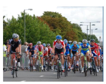
Spectator guides for the Olympic Cycling Road Races

Hundreds of thousands of people are expected to watch the Olympic road races in Surrey this weekend as cycling fever mounts on the back of Bradley Wiggins' Tour de France win.