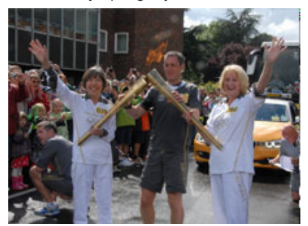
Torch Relay cheered across Surrey